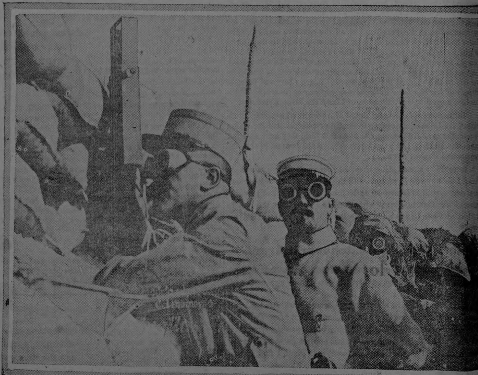
Interesting photograph which shows several French officers in a trench making use of the periscope at daybreak to notice if the enemy has any movement during the night. Note the masks to protect them against German gases.

Importante fotografia que muestra a varios oficiales franceses en una chinchera de la región Champagne, mirando por el periscopio al amanecer, si el enemigo hizo algún movimiento durante la noche. Nótese que los franceses tienen puestos respiradores y aparatos a la vista, para protección contra los gases alemanes. Los franceses en toda la línea de trincheras en la frontera alemana, usan estos aparatos constantemente, pues saben que los alemanes aprovechan todas las oportunidades para atacar con los gases venenosos.