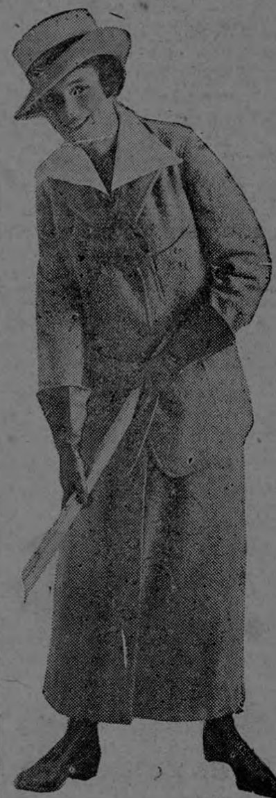
A JUVENILE EFFECT

ROSE ANGORA WOOL DEVELOPS A SMART GOLFING OUTFIT.